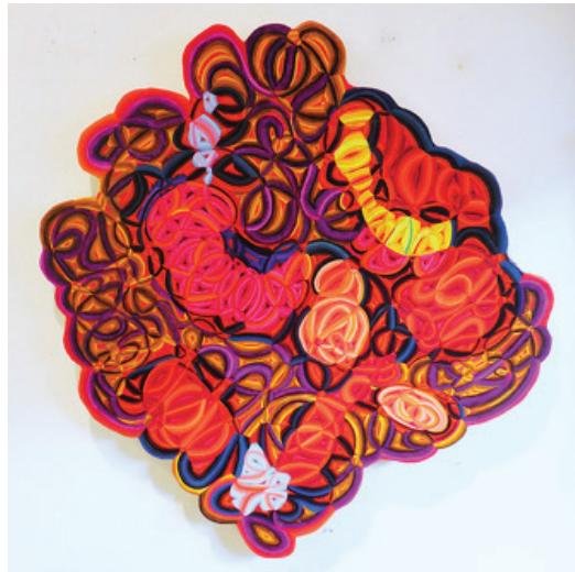
SPIDER HATCHERY - Gouache on Plywood