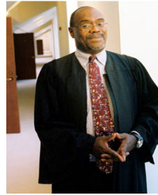
The Honorable Leslie E. Harris

https://www.focusingoneducation.com/alumni/donations/