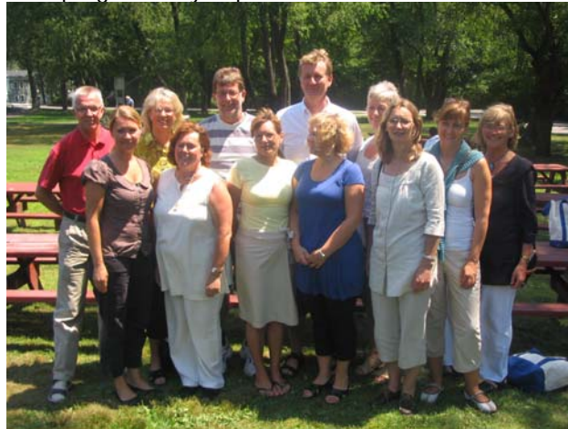
The Swedish educators pose during a break from their NITE lessons