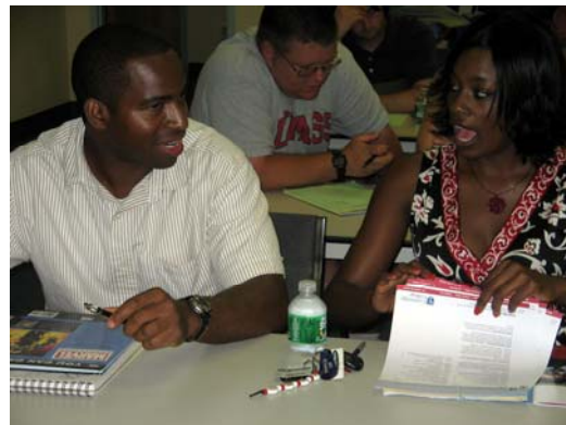
Students and guests took advantage of the Future Works career center (left) and information sharing during the program sessions (right) during the Springfield Center's Enrollment Extravaganza.