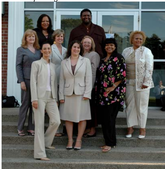
The Ed.D. cohort takes a break from presenting