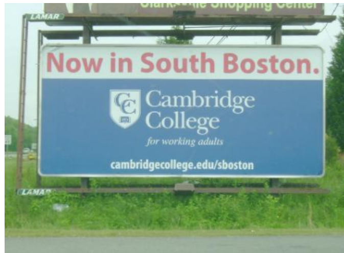
The billboard location: RT.58 .75 MI.E/O RT.501-SOUTH BOSTON FW.