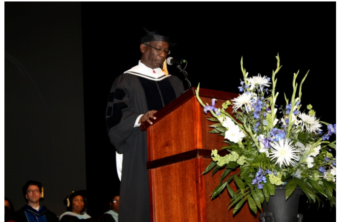
Graduates gather before the ceremony (left). Minister Jones delivers the commencement address (right).