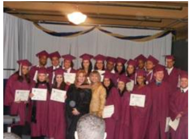
Graduates from the Ladder to Language Program