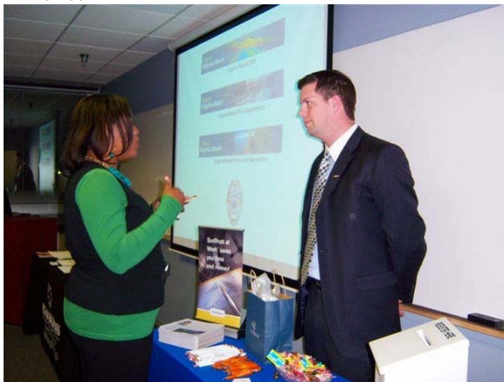
Attendees of the Cambridge College Career Night were able to interact with many local organizations and companies.